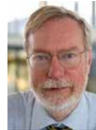
Paul COLLIER Oxford University

distinction for his work on monetary transmission mechanisms in Tanzania. He also received a BA in economics and international development studies from McGill University.