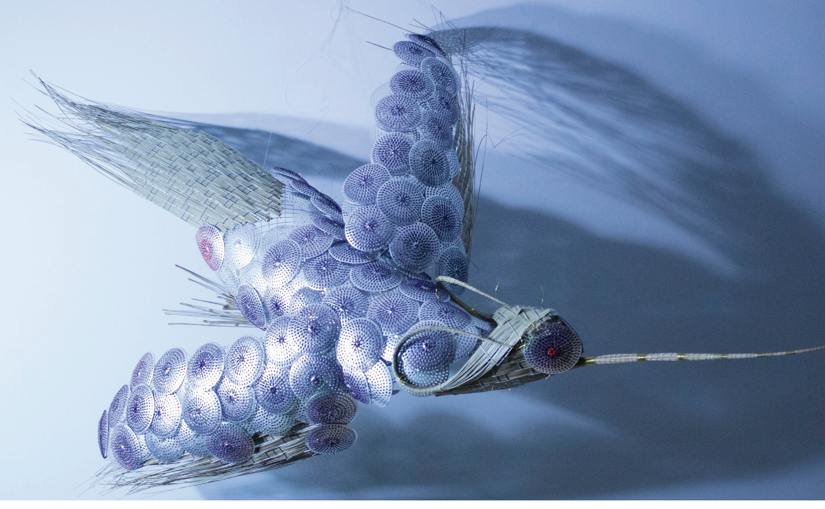
"Water Go Find Enemy" (above) and "Exit Only No Entry" by Adejoke Tugbiyele